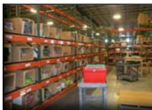
^ In the warehouse, products are picked for customization

Just this month, Thirty-One finished construction on their production facility at 231 Commerce Boulevard in Johnstown. This facility has 97,000 square feet and sits on 31 acres. By the end of January, they plan to have 150 workers on board, including jobs in the warehouse and distribution, production and office. The building features a large conference facility, allowing consultants to convene at various times of the year for training and meetings. There are also plans for a retail shop in the lobby that will feature some of their signature products.