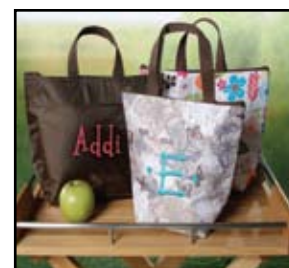
^ Many of the products may be personalized as shown above