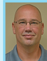
Chuck Moore Food Pantry Network of Licking County